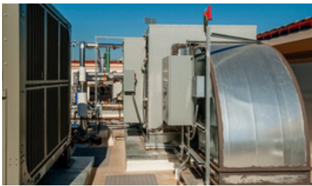
Centralized Commercial HVAC Systems (These are large-scale systems designed to cool entire commercial buildings. They include rooftop units, chillers, and air handling units.)