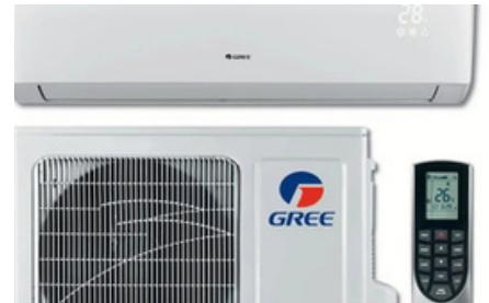
Air Conditioning Spare Parts Supplies of Ac spares, Fans & Diffusers, Condensing Units Evaporators, DUCTLESS, MINI-SPLIT AC, Portable AC Sunction Fan Inline, Axial Duct Fan, etc