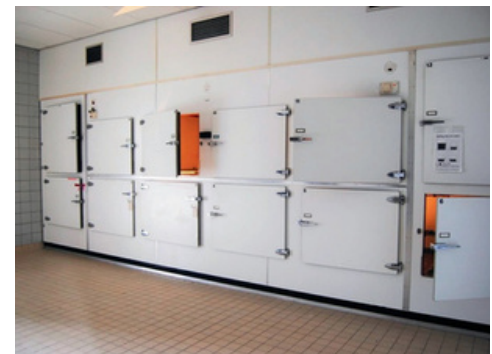
Mortuary Cold Rooms