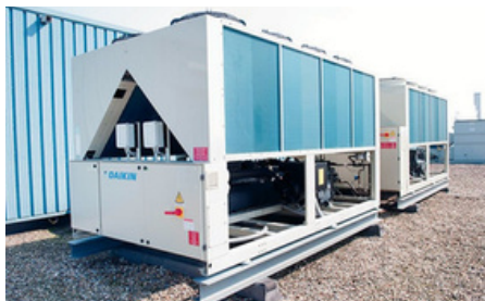
Chillers Chillers are used for cooling large commercial spaces and are often found in office buildings and industrial settings.