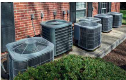
Package Units These are self-contained HVAC systems used for smaller commercial spaces. They include both heating and cooling components in one unit.