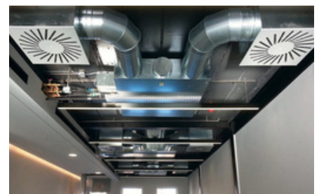
Ducted Air Conditioning Systems These systems use ductwork to distribute cool air throughout a building and are commonly used in larger commercial spaces.