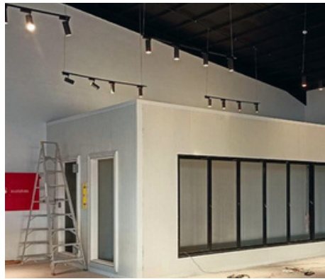
Custom Cold Rooms