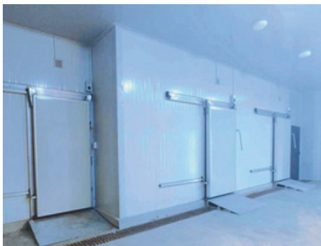
Cold Storage Warehouses