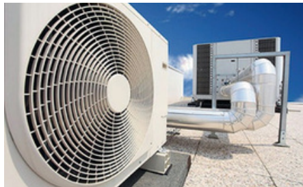
VRF (Variable Refrigerant Flow) Systems VRF systems provide efficient heating and cooling for larger commercial spaces. They offer zoning capabilities and can simultaneously heat and cool different areas.