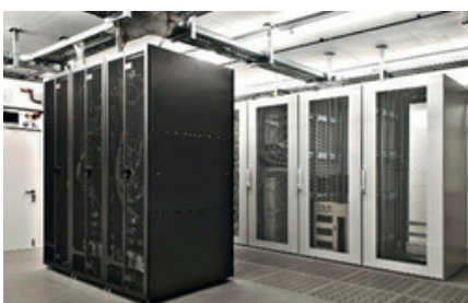
Server Room Cooling Specialized cooling solutions for data centers and server rooms to maintain optimal temperatures for sensitive equipment.