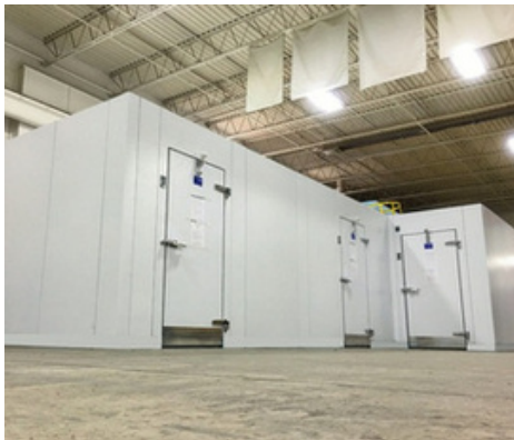
Walk-In Coolers and Freezers: