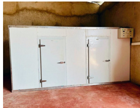
Freezer Cold Rooms: