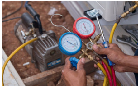
Commercial HVAC Maintenance Contracts Scheduled maintenance and repair services to ensure the proper functioning of commercial HVAC systems.