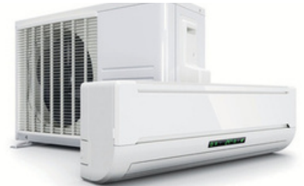
Commercial Split Systems These systems combine indoor and outdoor units and are suitable for cooling specific commercial zones or areas.