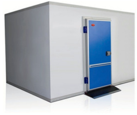
Pharmaceutical Cold Rooms